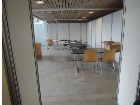
Racket control room