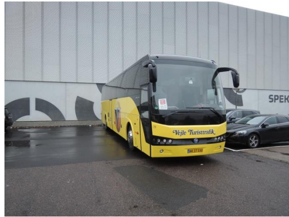
Bus for standings

Venue: The competition was held in DGI-HUSET Center. The main competition hall was Spektrum. All the facilities in the Venue were excellent. There was a training hall as well as a warm up hall. At the main hall we had a big Call Area and a Racket Control Centre. In the first floor were LOC front office, Media Centre, Umpires and ITTF PTT Officials facilities. In the ground floor there were enough accessible toilets, a bar, a resting room and a wheelchair storage place, a lunch area as well as a bar and a shop.