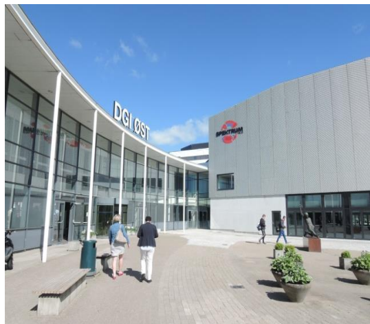
Venue and Spektrum hall

Venue: The competition was held in DGI-HUSET Center. The main competition hall was Spektrum. All the facilities in the Venue were excellent. There was a training hall as well as a warm up hall. At the main hall we had a big Call Area and a Racket Control Centre. In the first floor were LOC front office, Media Centre, Umpires and ITTF PTT Officials facilities. In the ground floor there were enough accessible toilets, a bar, a resting room and a wheelchair storage place, a lunch area as well as a bar and a shop.