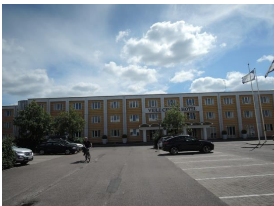
Vejle Center hotel