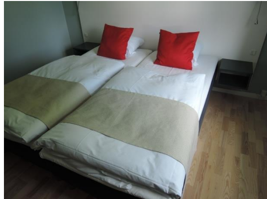
Room in Scandic

Accreditation: All participants received a gift bag with general informations, some presents and an accreditation card.