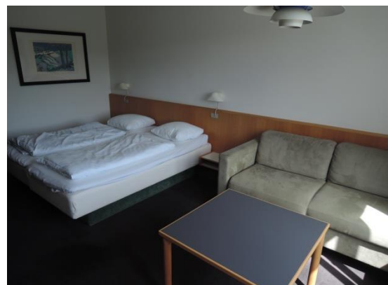
Room in Vejle center