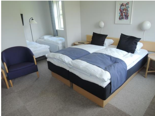
Room in Haraldskjear